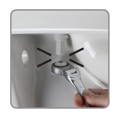
Snap to Secure