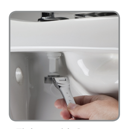
Tighten with Spanner