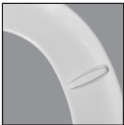
4 INTEGRATED BUFFERS