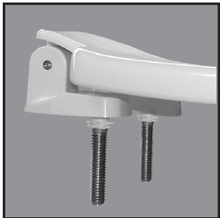
HYBRID STAINLESS STEEL/ THERMOPLASTIC HINGES